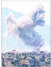
"In an all-out war, Hezbollah will be destroyed and Lebanon will be severely beaten," he added. Israel's military later said they were fully prepared. Hezbollah says it will not halt its attacks unless there is a ceasefire in the Gaza Strip. A Pentagon spokesperson said the United States did not want to see a wider regional war in the Middle East. Hochstein said he had been dispatched to Lebanon immediately following a brief trip to Israel because the situation was "serious". "We have seen an escalation over the last few weeks. And what President Biden wants to do is avoid a further escalation," Hochstein said.

Israeli Foreign Minister Israel Katz warned on Tuesday that a decision on an all-out war with Hezbollah was coming soon, even as the US tries to avert any escalation. US envoy Amos Hochstein was sent to Lebanon to try and cool tensions following an increase in cross-border fire along Lebanon's southern frontier that has escalated to Hezbollah hunting it could attack Haifa, Israel's third-largest city. Iran-backed Hezbollah has been trading fire with Israel for the last eight months in parallel with the Gaza war. Last week, the group fired the largest volley of rockets and drones of the hostilities so far at Israeli military sites, after an Israeli strike killed the most senior commander yet. Foreign Minister Israel Katz said in an X post that in the wake of threats by Sayyed Hassan Nasrallah, the group's head, to damage Haifa's ports that are operated by Chinese and Indian companies, "we are getting very close to the moment of deciding on changing the rules of the game against Hezbollah and Lebanon."