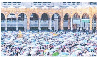
Pilgrims gather at the Grand Mosque in Mecca.

At least 60 Jordanians have died, an official said. Amman had on Tuesday given an official tally of 41. Other countries to report deaths during the Hajj this year include Indonesia, Iran and Senegal. However, most countries have not specified how many deaths were heat-related. Saudi Arabia has not commented on the toll. On Tuesday, Egypt's foreign ministry said Cairo was collaborating with Saudi authorities on search operations for Egyptians who had gone missing during the Hajj. Saudi authorities have re-